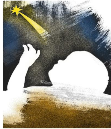
The Coming Messiah

Children's Musical Adult Choir Cantata Sunday, December 17 th at 10:45 AM Service