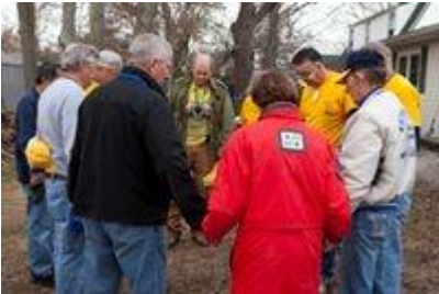
Local/State Missions/Disaster Relief

In February 2023, Baptists on Mission will host a series of Regional Mission Rallies across the state. These rallies (10 of them) will highlight the variety of opportunities NC Baptists have to be involved in missions across our state, nation and world. Featured will be worship, testimonies, mission videos, and a prayer time for missions. These rallies are for anyone in your church who is interested in missions. A main focus of these rallies will be state, national, international partnerships and projects (including Disaster Relief) and the NC Missions Offering.