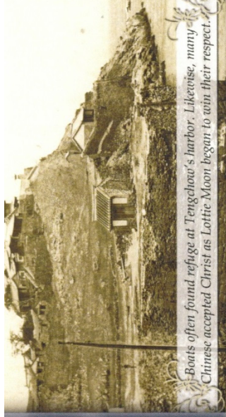
Boats often found refuge at Tengchow's harbor. Likewise, many Chinese accepted Christ as Lottie Moon began to win their respect.