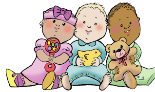
Births in the Church Family